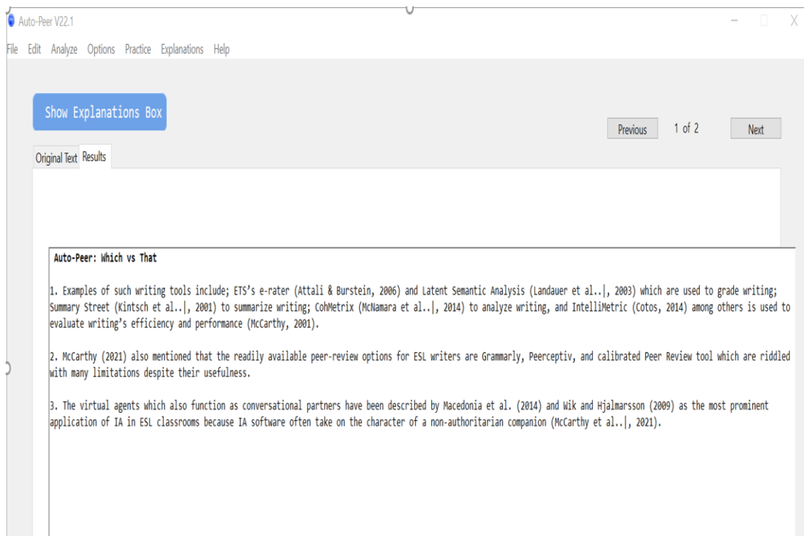
Figure 1. The Auto-Peer interface showing links to various automated writing functions.

Peer frequently supports students' engagement in self-review after which they justify or modify their writing decisions.