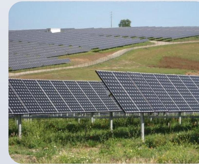
Figure 1 –Solar energy absorbing panels [4]