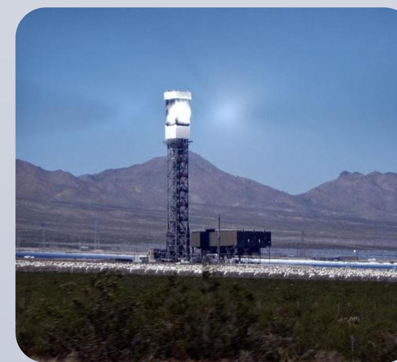
Figure 2 – Ivanpah Solar Tower [4]