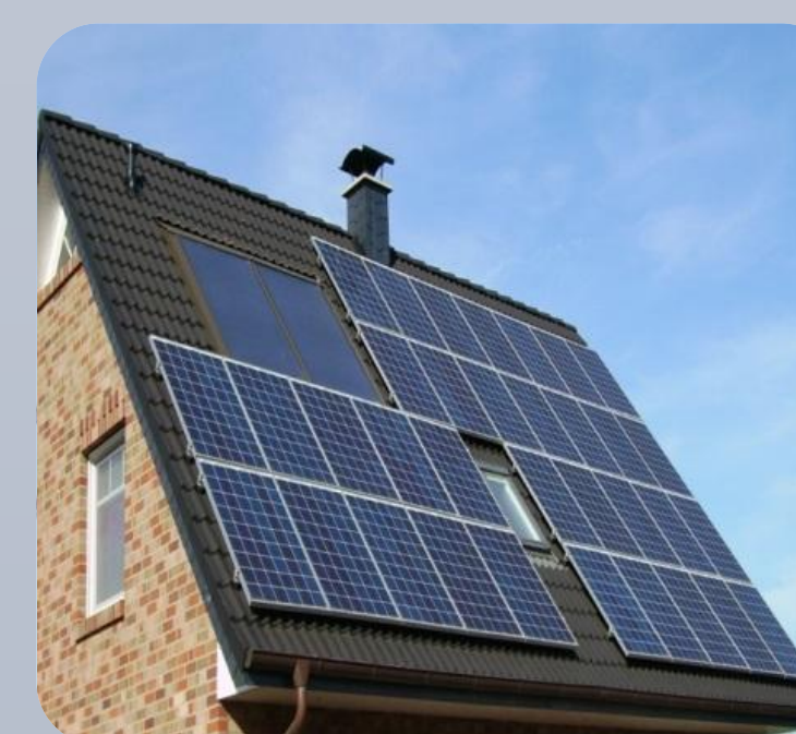
Figure 3 – Solar Panels on the roof top [4]