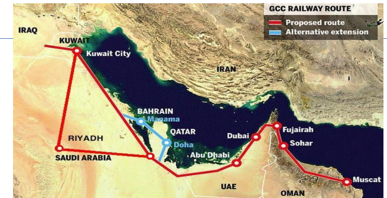
Figure 4: Possible Train Route Connecting the GCC

From an engineering standpoint, finding the most suitable route for travel, designing the railways to withstand high climate and natural disasters and perhaps increasing the speed of the train to increase efficiency are all points that must be evaluated. Placing a rubber bearing for example under the trains path will allow for minimal damage if an earthquake is to occur. Also having air conditioning systems under the train itself will allow for it to remain cool at all times.