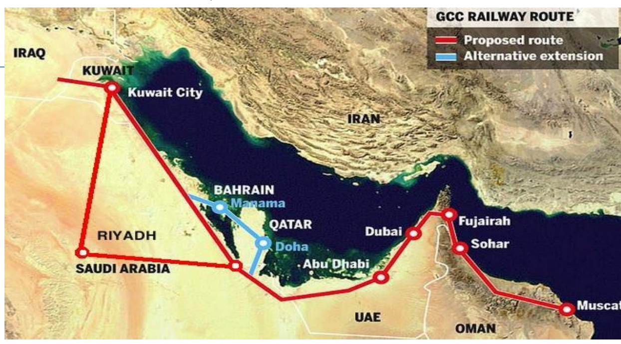
Figure 4: Possible Train Route Connecting the GCC

From an engineering standpoint, finding the most suitable route for travel, designing the railways to withstand high climate and natural disasters and perhaps increasing the speed of the train to increase efficiency are all points that must be evaluated. Placing a rubber bearing for example under the trains path will allow for minimal damage if an earthquake is to occur. Also having air conditioning systems under the train itself will allow for it to remain cool at all times.