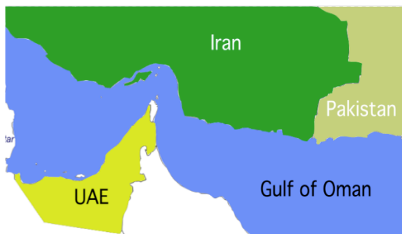
Figure 1: Gulf of Oman Map

Is importing water into the UAE a practical solution from technological, political and environmental perspectives?