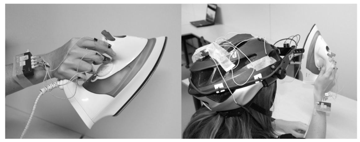
Figure 1. Active markers on fingers & head

The chosen route used in the experiment was to use an active system, with the pulsed LED's markers being attached to the head of the user and to one of their hands (fig.1.). Through the associated biomechanical software it was then possible to extrapolate the participants head and hand movements. Markers were also originally placed on the actual product but the participants eyes were drawn repeatedly to the markers rather than the product itself. To overcome this issue new virtual markers were created based on the participant's finger markers positions. These were used to produce a new virtual 'bone' that represented the real product's position and orientation in space. This only worked whilst the user held the product in a given manner, when they moved their hand the virtual marker positions and resultant virtual bone was lost.