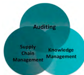
Figure 1. The realm of the K-SCM knowledge audit.

The knowledge audit methodology for KCRM is used as a template for the methodology for K-SCM, which will be discussed below. The concept of K-SCM knowledge audit lies at the nexus of the KM, auditing, and SCM literatures (Figure 1). The knowledge auditing process has been applied to knowledge-enabled CRM programs to identify and maximize the utilization of both existing and untapped customer knowledge resources [49] (also see Tiwana [50]; Tiwana [51], and Daghfous et al. [8]). It has also been used to better understand the processing and utilization of customer knowledge, to identify the gaps, barriers, and deficiencies of KCRM processes, and to achieve a better understanding of customer expectations [49]. The KSCM knowledge audit approach outlined in this paper provides a framework for ensuring that the various stages of the SCOR model are knowledge-enabled via a systematic approach to KM.